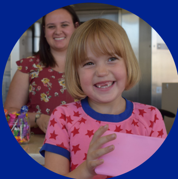
YOUNG AMERICANS BANK